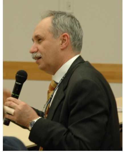
2008 ISWE3 in Tokyo