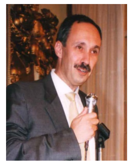
1997 EACWE2 in Genova

He seemed to have hastened to his death, leaving this great classic for us.